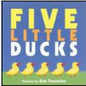
Five Little Ducks by Dan Yaccarino