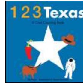
123 Texas by Puck