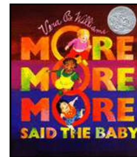
“More More More” Said the Baby: 3 Love Stories by Vera Williams